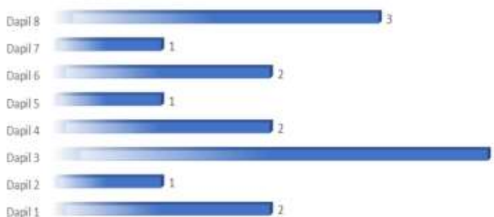
Figure 5.2 Characteristics of Respondents by electoral area

Figure 5.1 Characteristics of respondents based on the bearer party The highest number of female legislators came from the PAN party, namely 3 people. This means that the National Mandate Party (PAN) is a party that has potential female cadres in the electoral constellation in NTT. Meanwhile, when collected by electoral area, the largest number of informants came from electoral district 3 which included East Sumba, Central Sumba, West Sumba, and Southwest Sumba Regencies as shown in the following diagram.